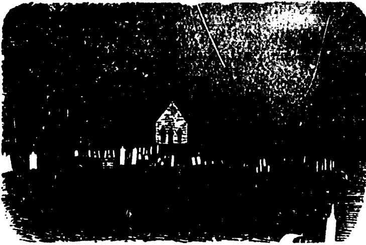
OLD HANOVER CHURCH.

T HE following fragments of history, gathered from the minutes of the Presbyteries of Donegal and of Carlisle; the records of the Board of Trustees of Hanover Church, some very incomplete records of the last pastor of the church, from tax lists, tradition, &c., are respectfully dedicated to the descendants of "Old Hanover," by one of their number who has felt a special interest in rescuing from oblivion whatever memorials he could obtain of a church whose