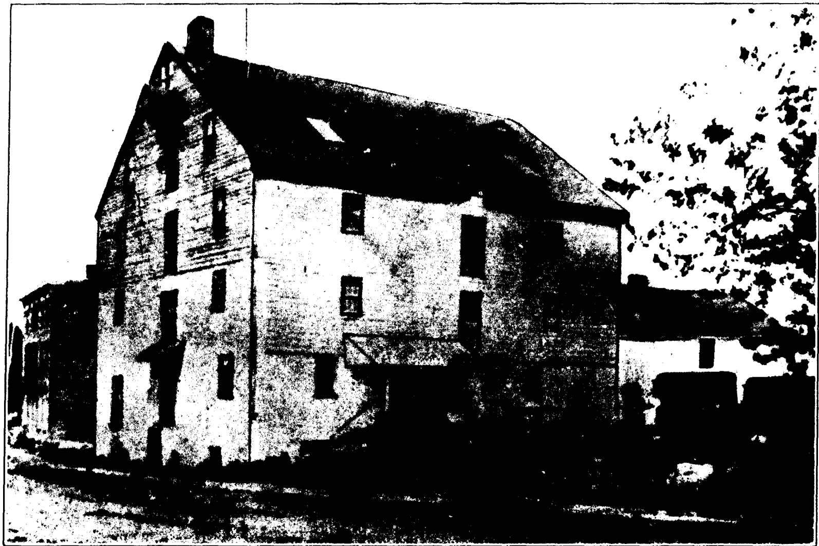
THE SHELMIERE GRIST MILL.