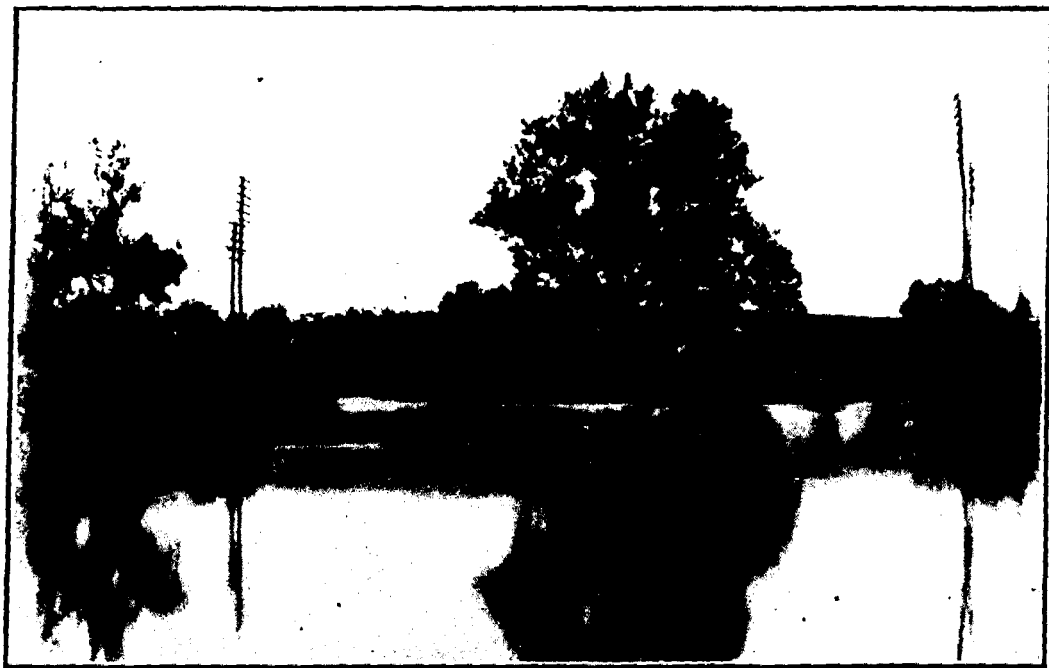
THE LANCASTER PIKE BRIDGE, BUILT IN 1802.