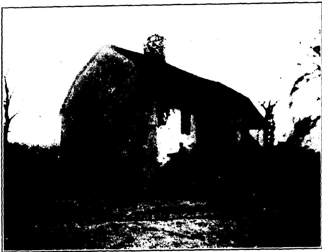
MILL OF REVOLUTIONARY DAYS. STILL RUNNING.