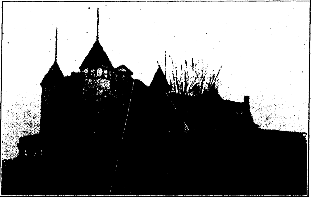
SWAN HOTEL. BOROUGH ORGANIZED HERE MAY 28, 1859