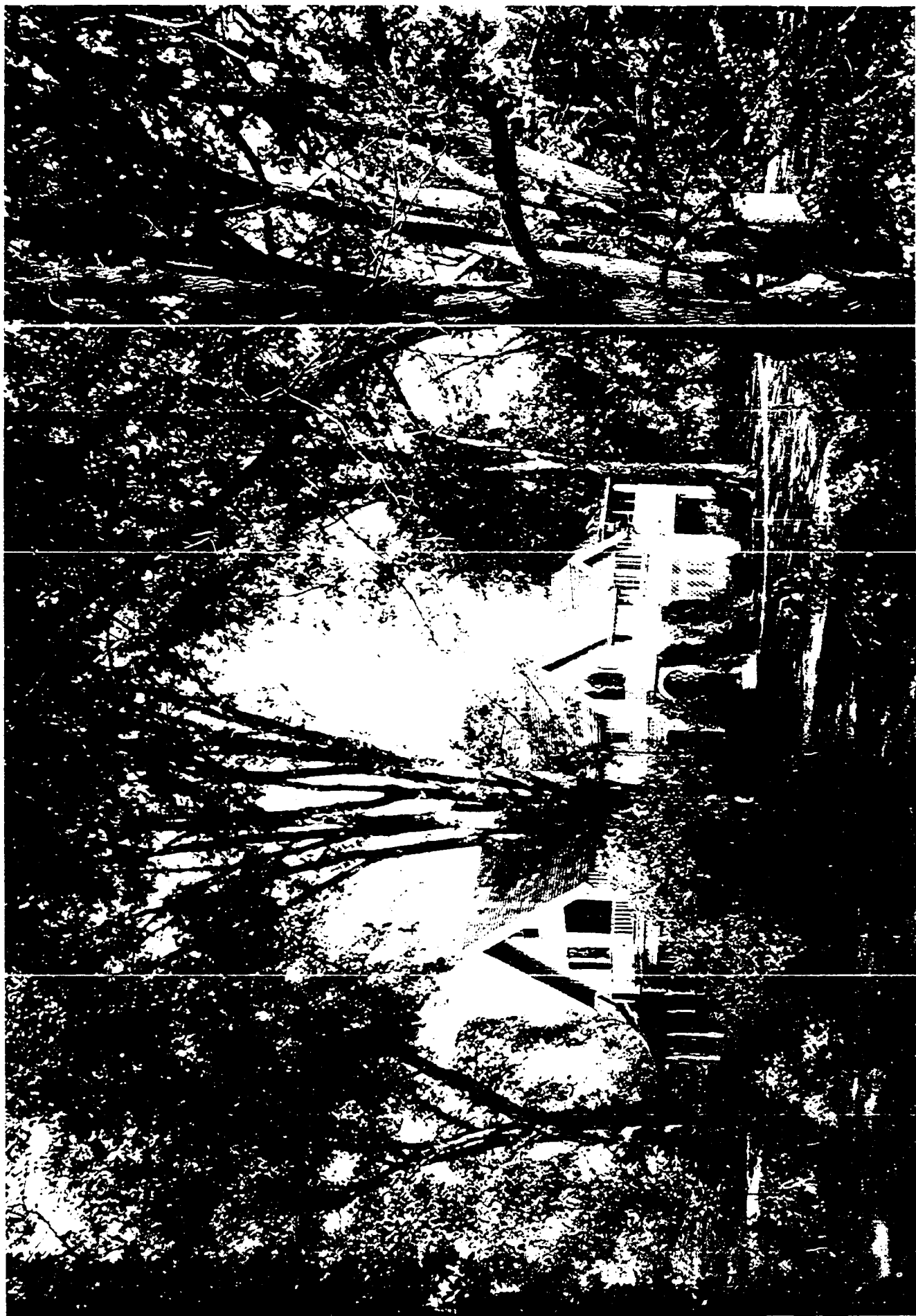
TROUTBECK IN 1916