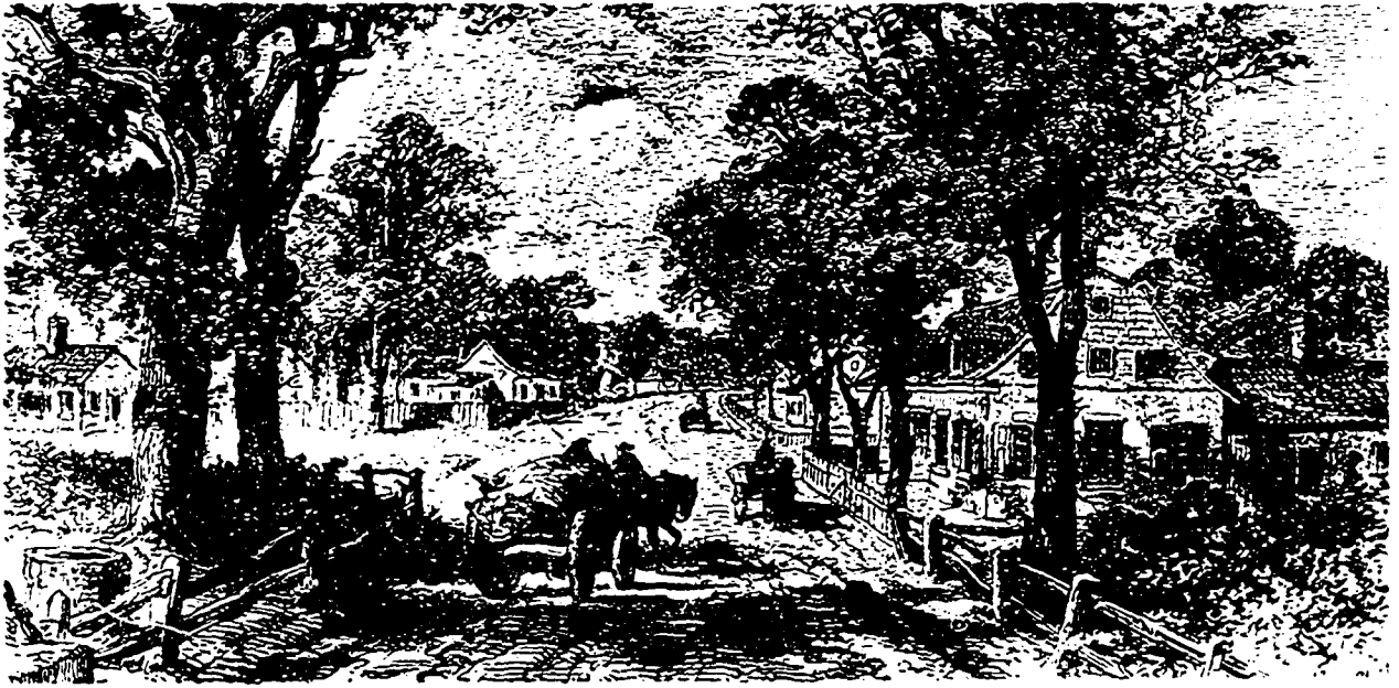
Early Brooklyn Farms