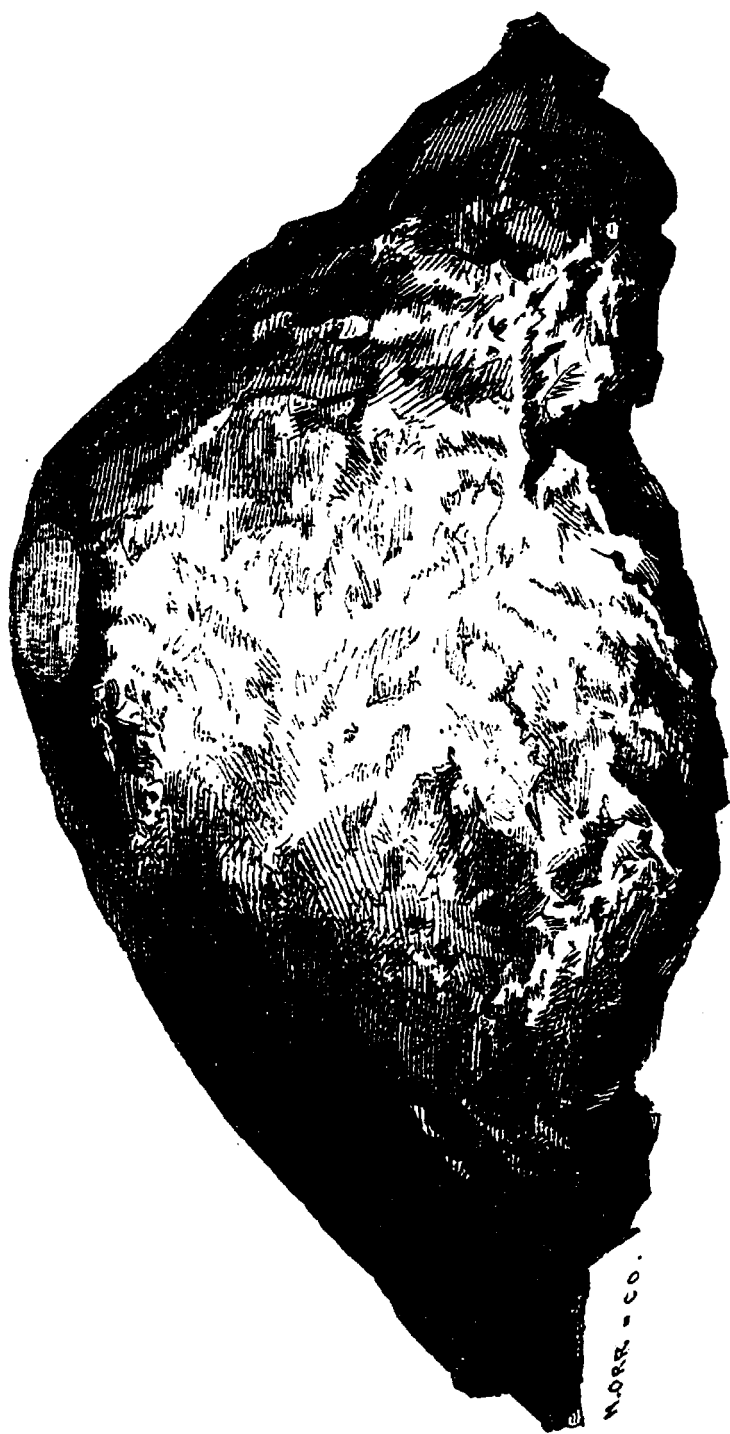
NORTH VIEW OF THE HIGH ROCK, SARATOGA SPRINGS, N. Y.