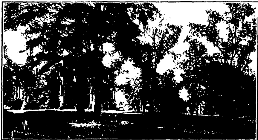
OLD NUTLEY MANOR