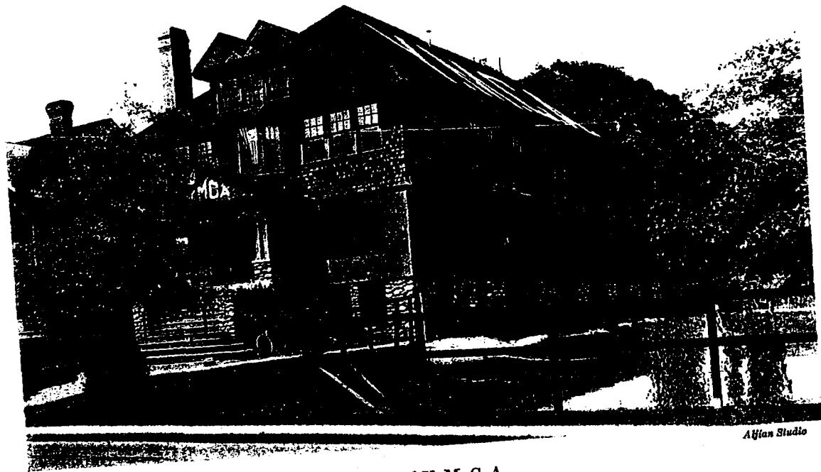
Ridgewood Y. M. C. A.