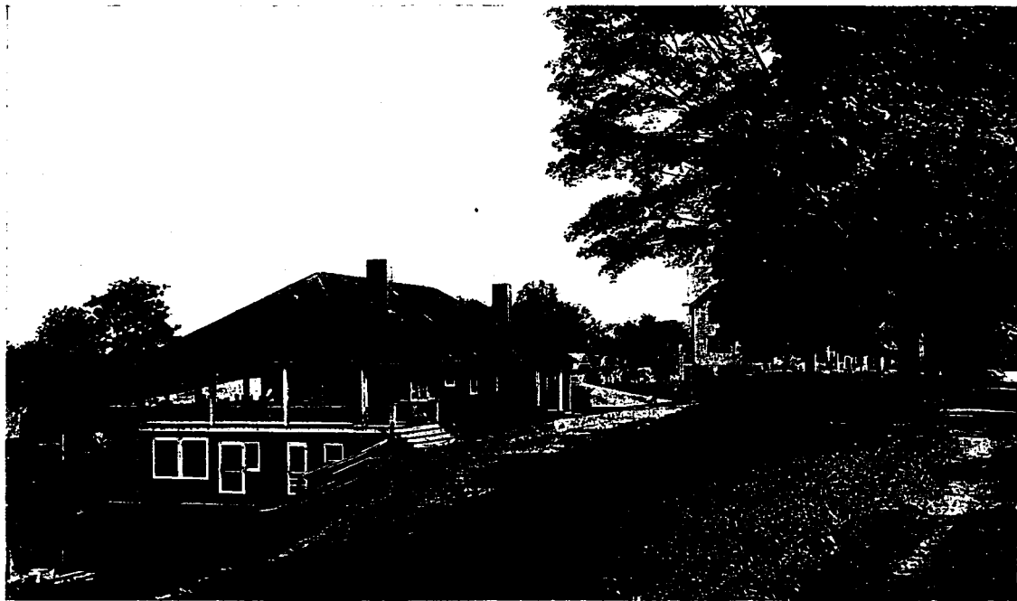
The Town Club.