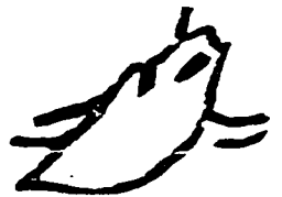
Mark of POUANAS & KAUSSE the same nation but different Chiefs.