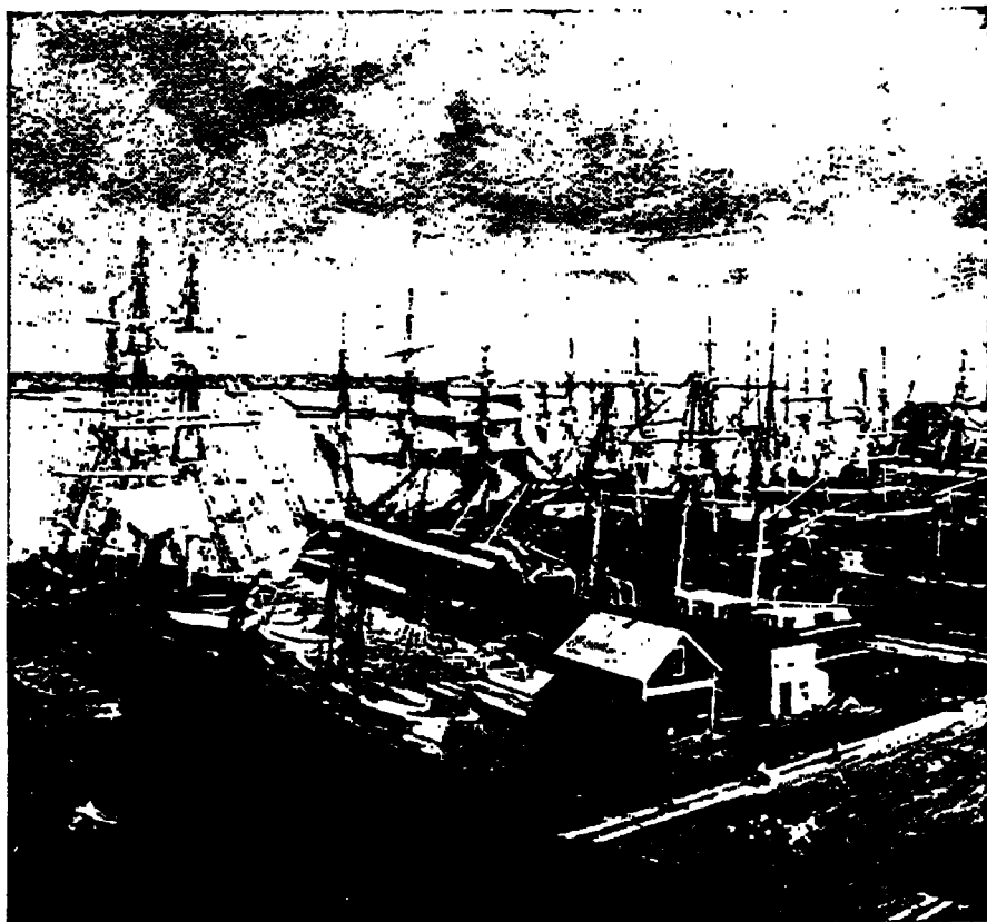
New Bedford Wharves in the Hey-dey of Whaling