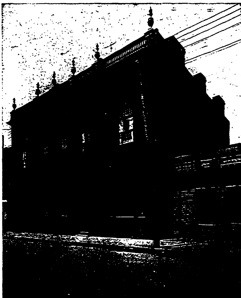
The Rogers Building, with the main entrance to the museum