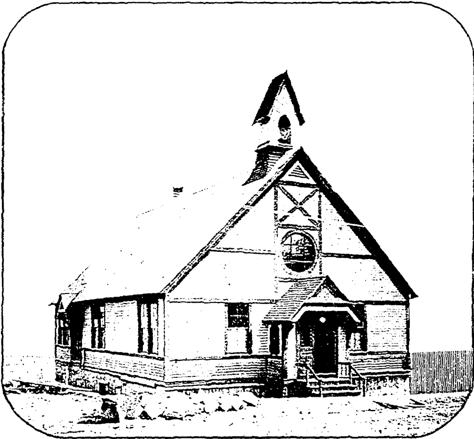
THE FIRST CHAPEL.