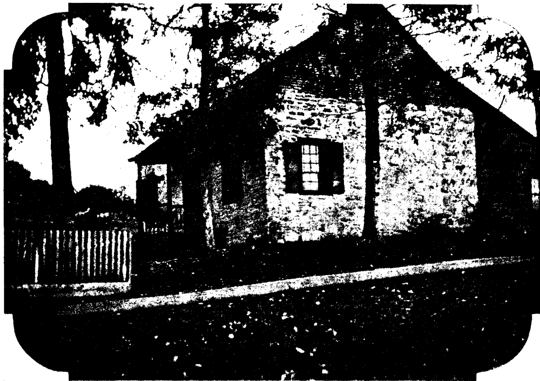
OLD WESTERVELT HOUSE BUILT BY KASPAURUS WESTERVELT, AT NEW HACKENSACK, NEAR POUGHKEEPSIE.