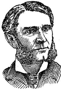
WILLIAM DREW WASHBURN.