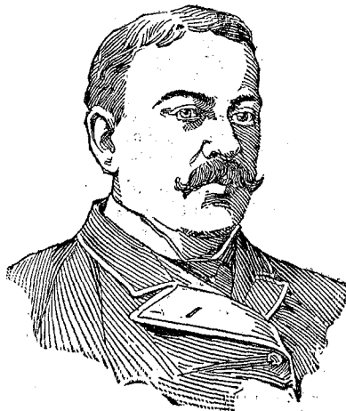
HEMSTEAD WASHBURN, MAYOR OF CHICAGO IN 1892.