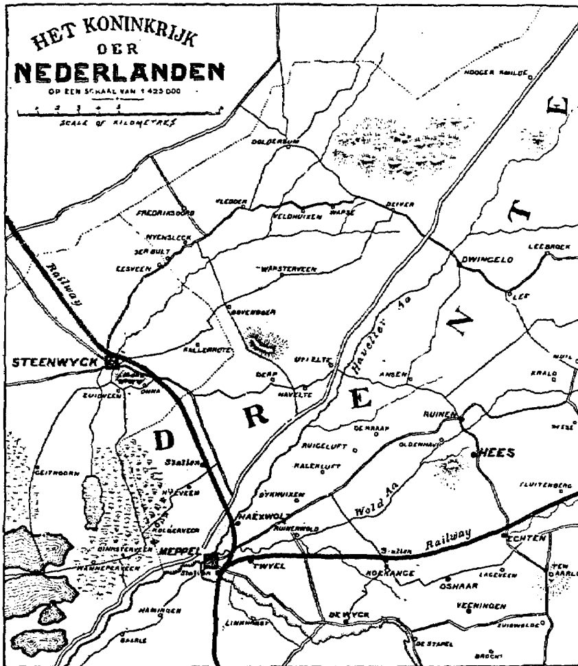
Map of a part of the Province of Drenthe, Holland, showing the location of the village of Hees. By Dr. I. Dornseiffen, Amsterdam, 1878.