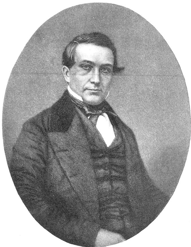
HON. PHILIP FRANCIS THOMAS Governor of Maryland, 1848-1851