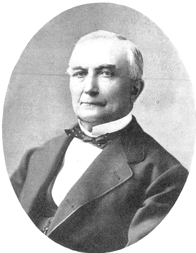
HON. PHILIP FRANCIS THOMAS 1810-1890