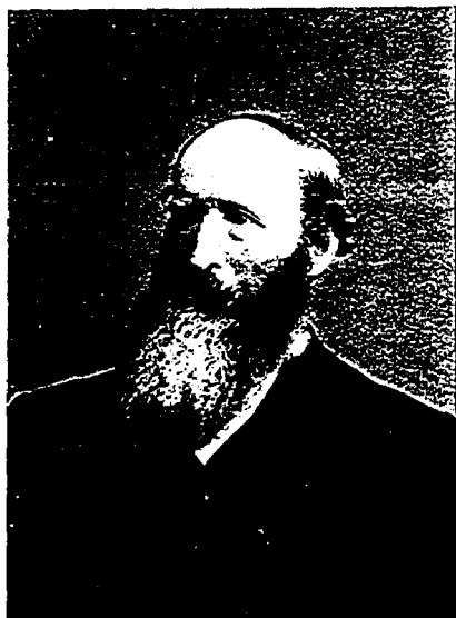
ROSWELL TEMPLE. See page 113. TRUMAN TEMPLE. See page 170.