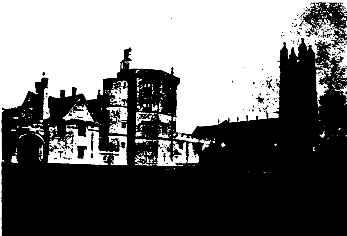
The church where the Thayers of Thornbury, England worshipped, dating back to about 1340.