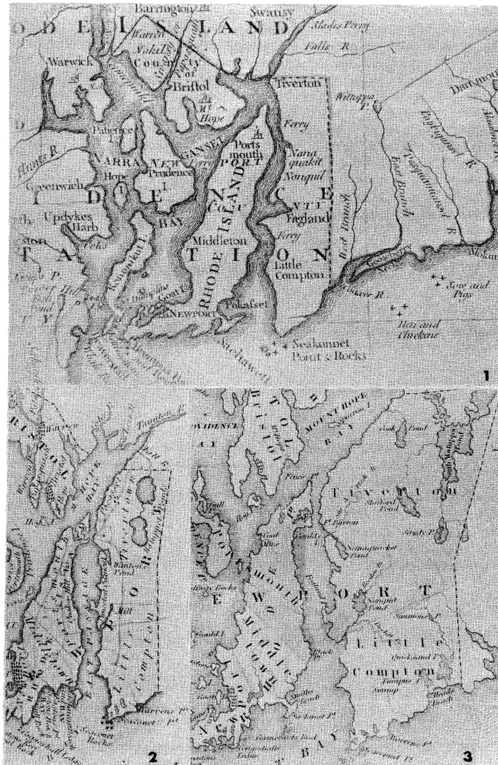
Maps by: 1. T. Jefferys 1774-1778 2. Carey and Lea 1827 3. Bradford and Goodrich 1838-1846