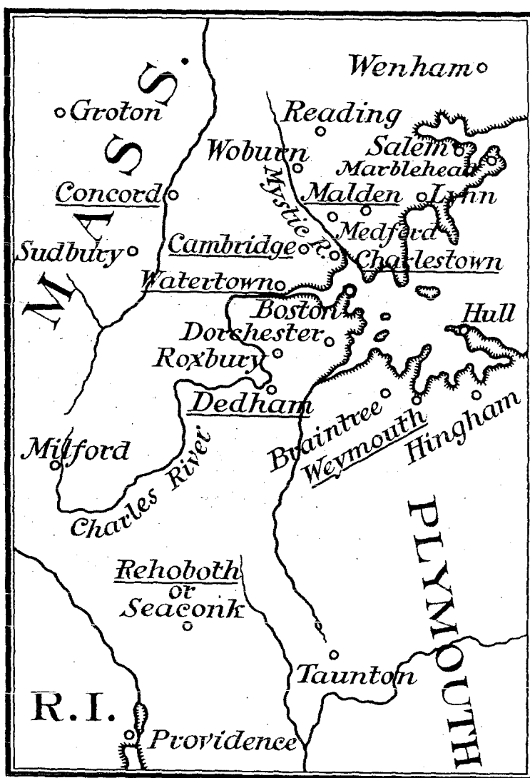
A Map of 1650 (adapted from one in J.A. Doyle's Puritan Colonies ) Showing Relative Positions of the Various Towns Named in this History.