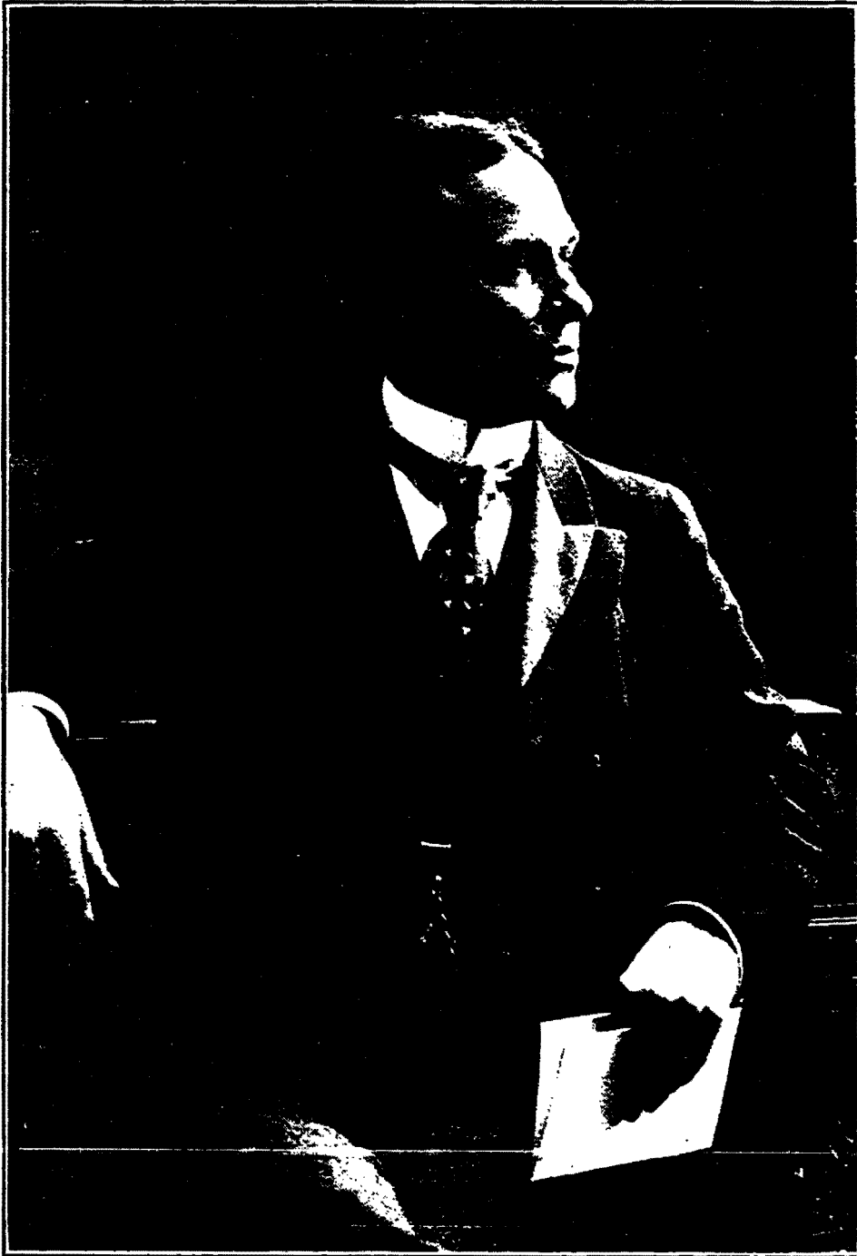
JACOB GOULD SCHURMAN, LL.D. President of Cornell University, 1903.