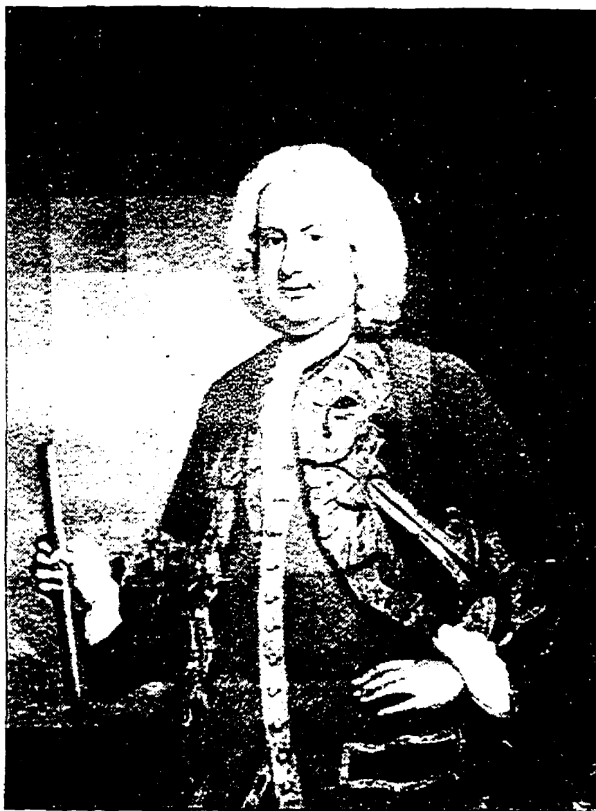
Lieutenant-General Sir William Pepperrell