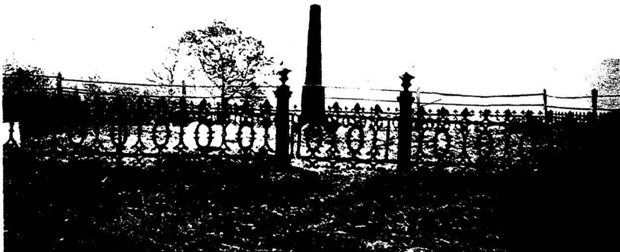
SCOVILL CEMETERY, SCOVILL HILL, Harwinton, Conn.