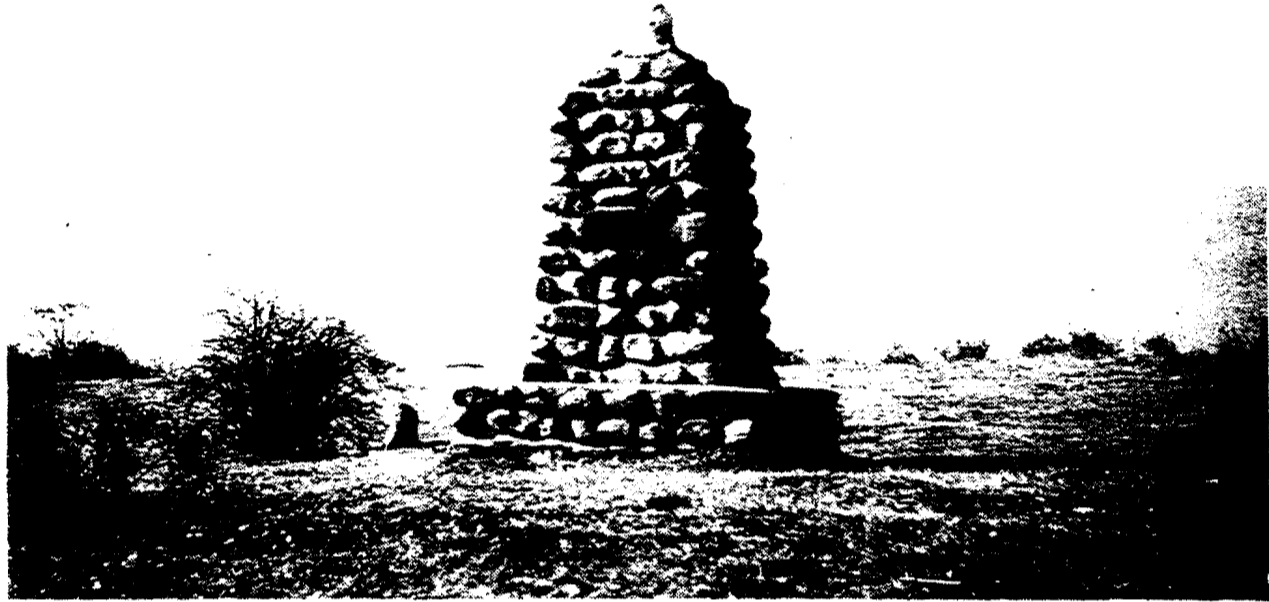
SCOVILL MEMORIAL, SCOVILL HILL, Harwinton, Conn.