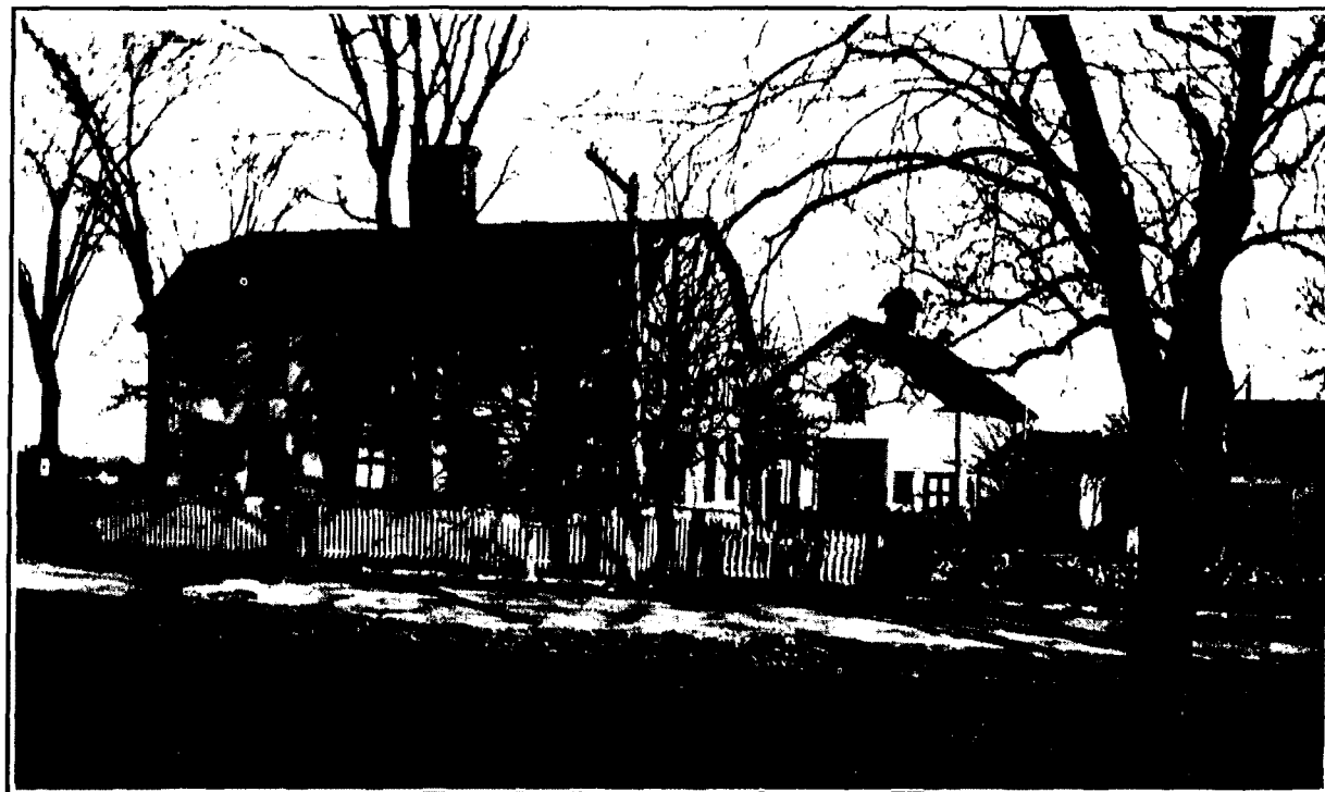
'THE READ HOMESTEAD AT READ'S CORNER, SOUTH SOMERSET', MASS.