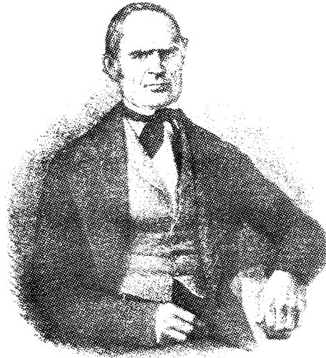
Gen. SETH K. KELLOGG