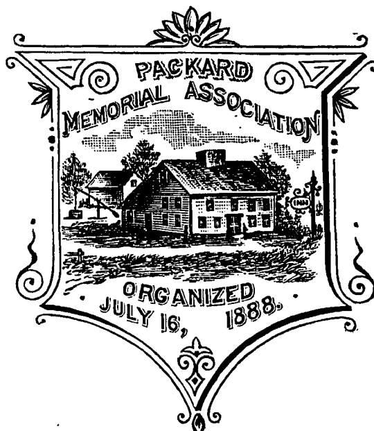
SEAL OF THE PACKARD MEMORIAL ASSOCIATION.