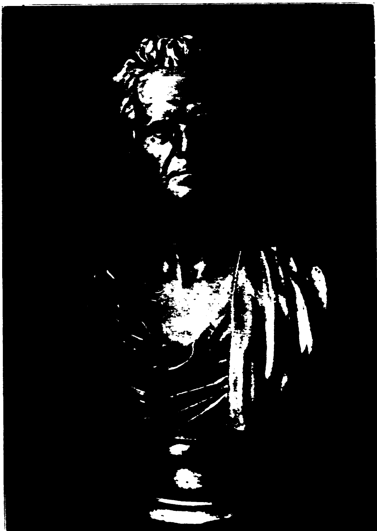
REV JOHN PIERPONT