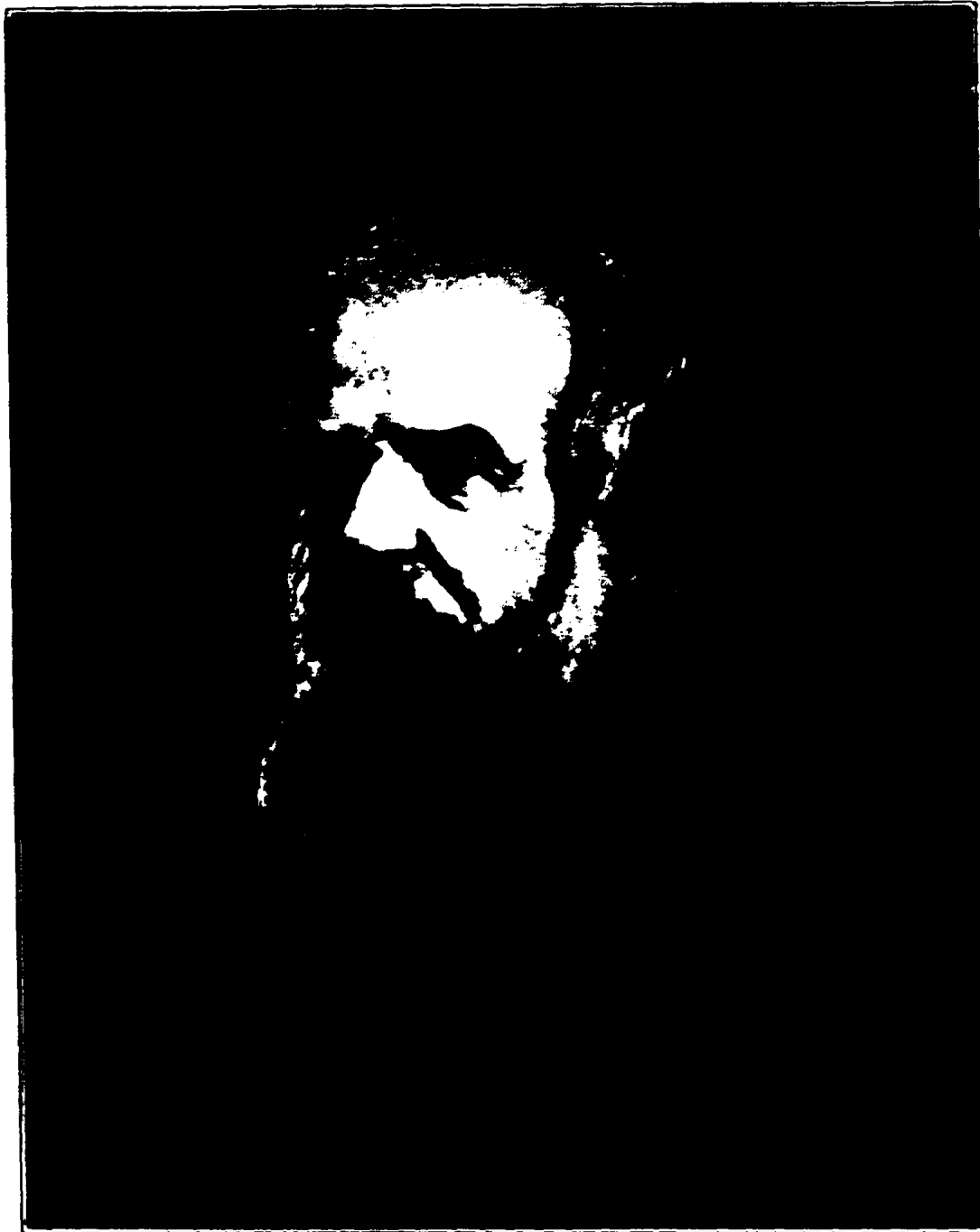
REV. JOHN PIERPONT. AT 80 YEARS