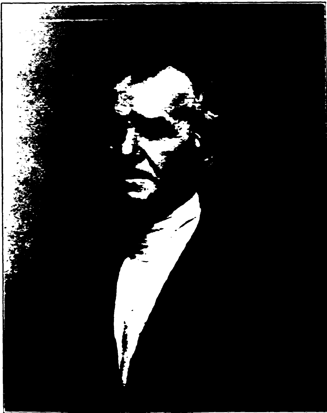
REV. JOHN PIERPONT AT 60.