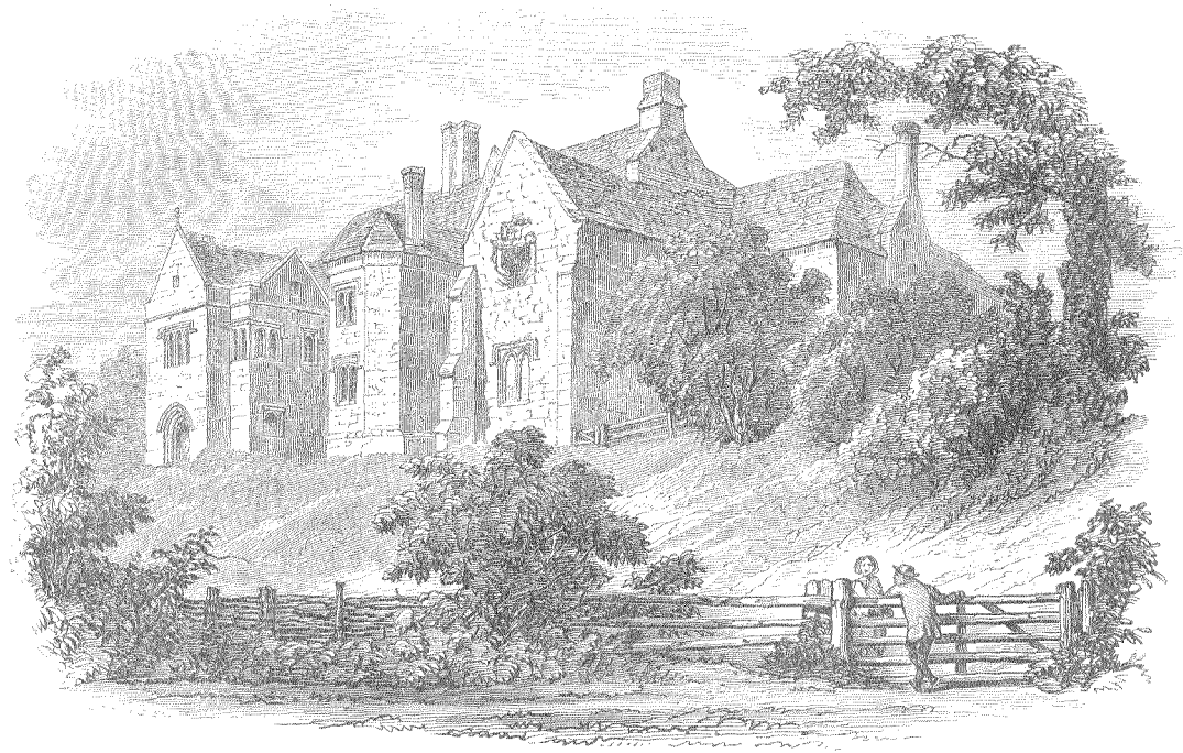
BREDE PLACE, 1858.