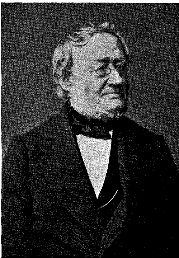
PROF. DR. CHARLES LOUIS MICHELET, BERLIN, GERMANY.