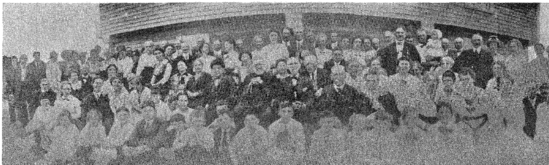
FIRST CLAN REUNION, 1917