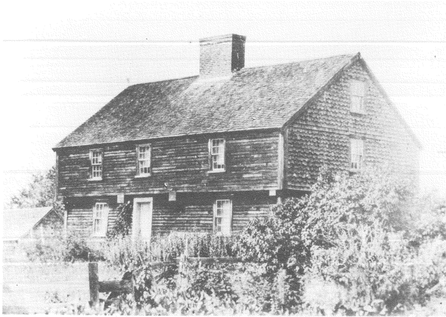
McINTIRE GARRISON Restored about 1910