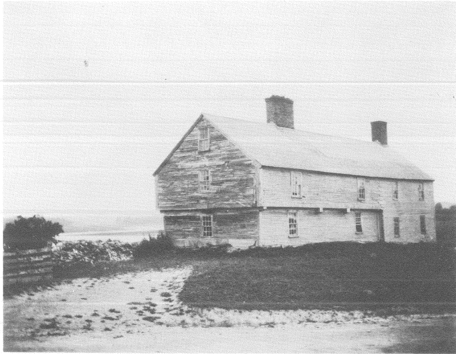
McINTIRE GARRISON Showing addition and just before restoration