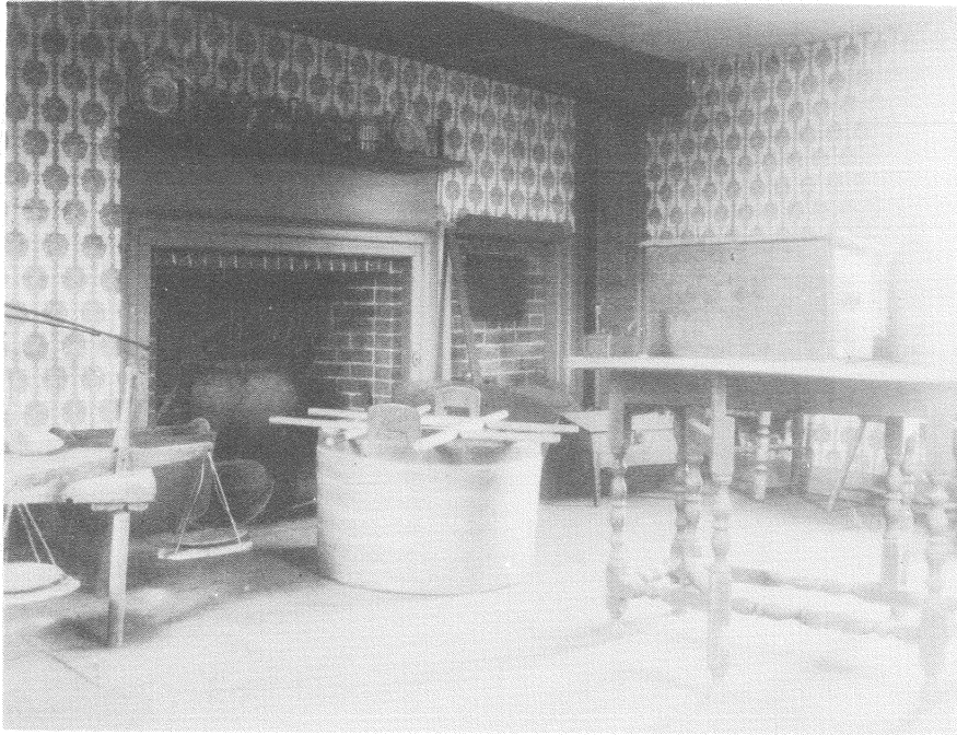
McINTIRE GARRISON Interior scene after restoration