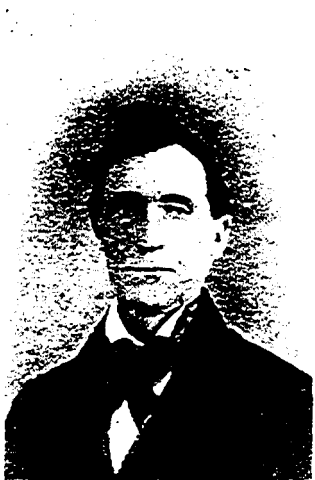
HON. GEORGE MCCOY Born June 27, 1800; died April 6, 1863.