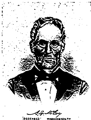
JUDGE ANGUS C. MCCOY Born March 13, 1789; died Oct. 12, 1865.