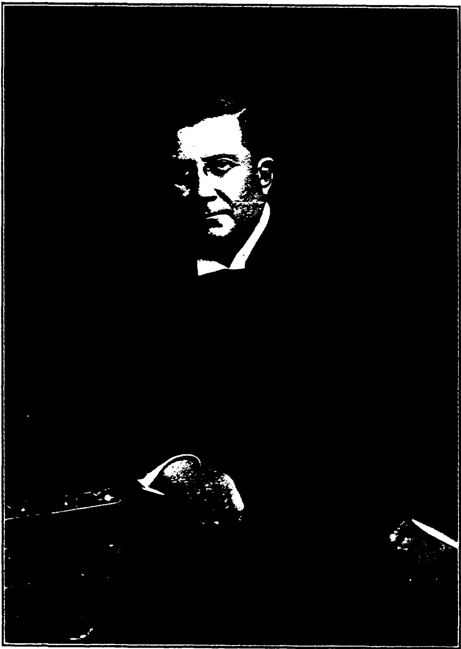
HON. CHAS. FRANCIS MURPHY