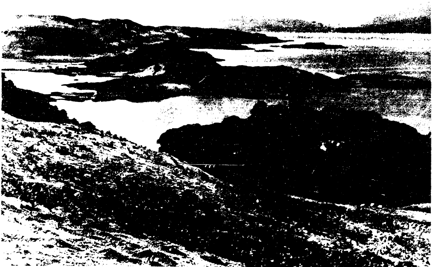
Looking west toward Firth of Lorn and Isle of Kerrera.

The entire estate is known as "Dunollie."