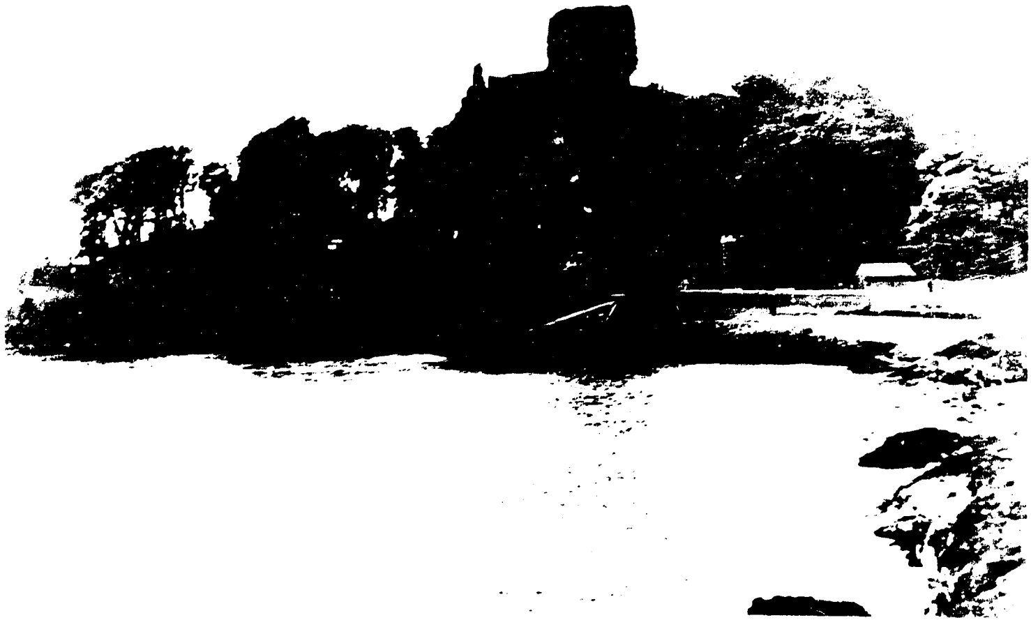
The castle (tower visible) is an ivy covered ruin. It was abandoned in 1740.