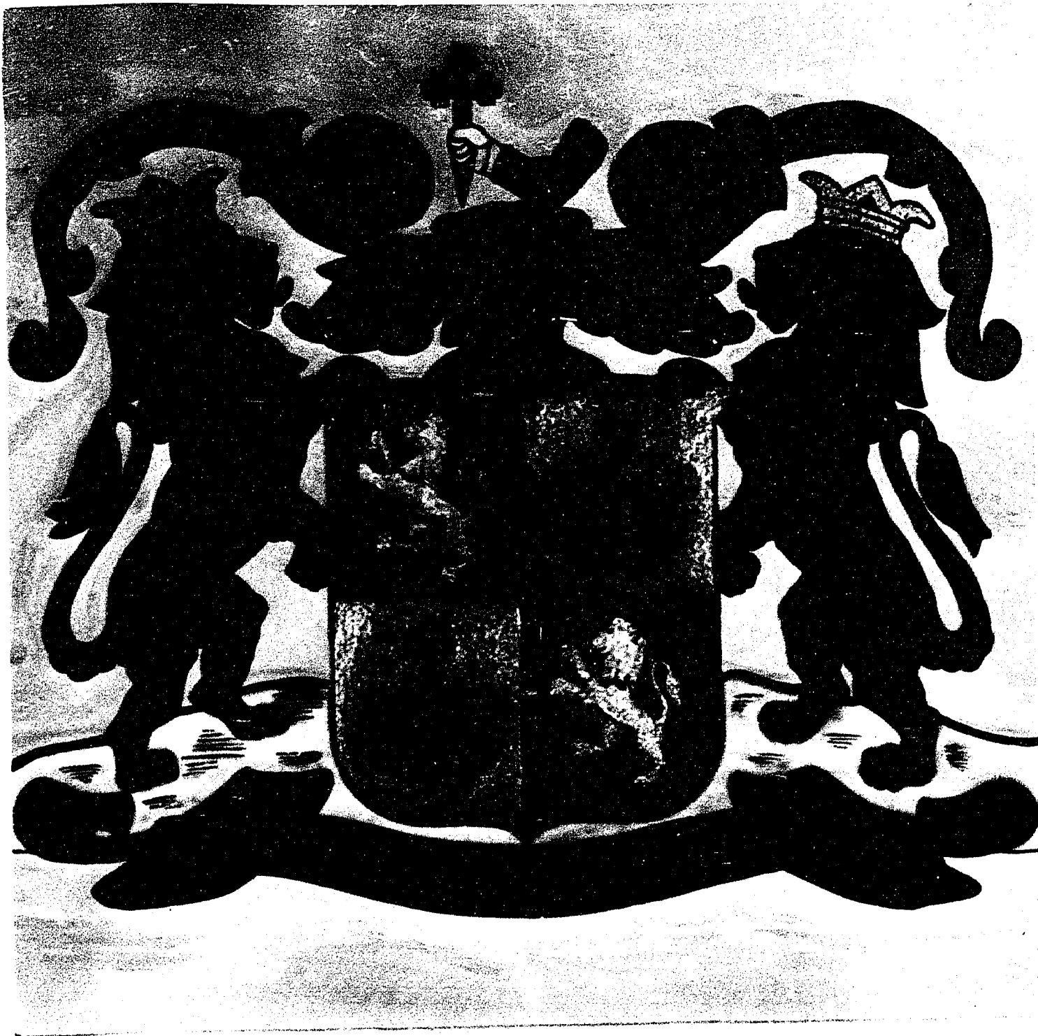
ARMS OF CHIEF CLAN MACDOUGALL (Clann Dughail)