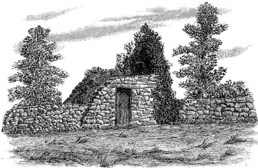
RUINS OF THE ORIGINAL, EDGAR HOUSE.