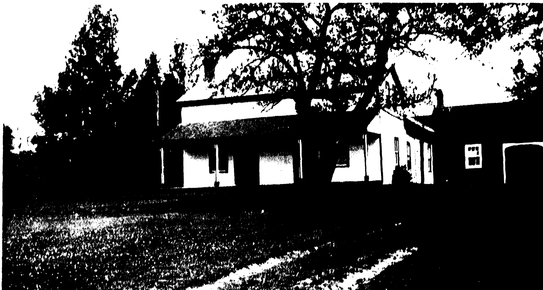
Old homestead of Crynis La Rue (No. 56), one-half mile west of Kirby, near Orono, Ontario, Canada. House built about 1830