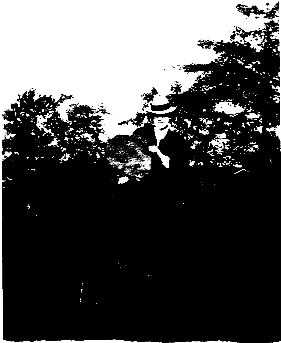
Standing in the old French Cemetery between Old Bridge and New Bridge, N. J., Fred H. Chapin, (No. 107), of Cleveland, Ohio, is holding a stone of reddish brown, bearing the following rough inscription: