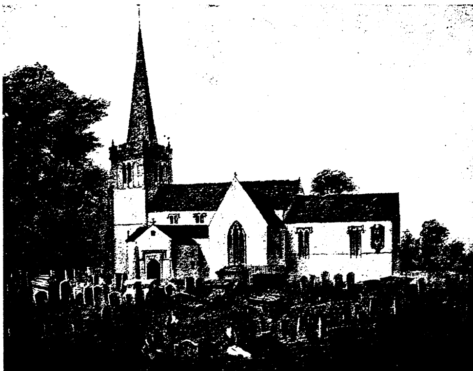
CHURCH AT DOWN AMPNEY Gloucestershire, England