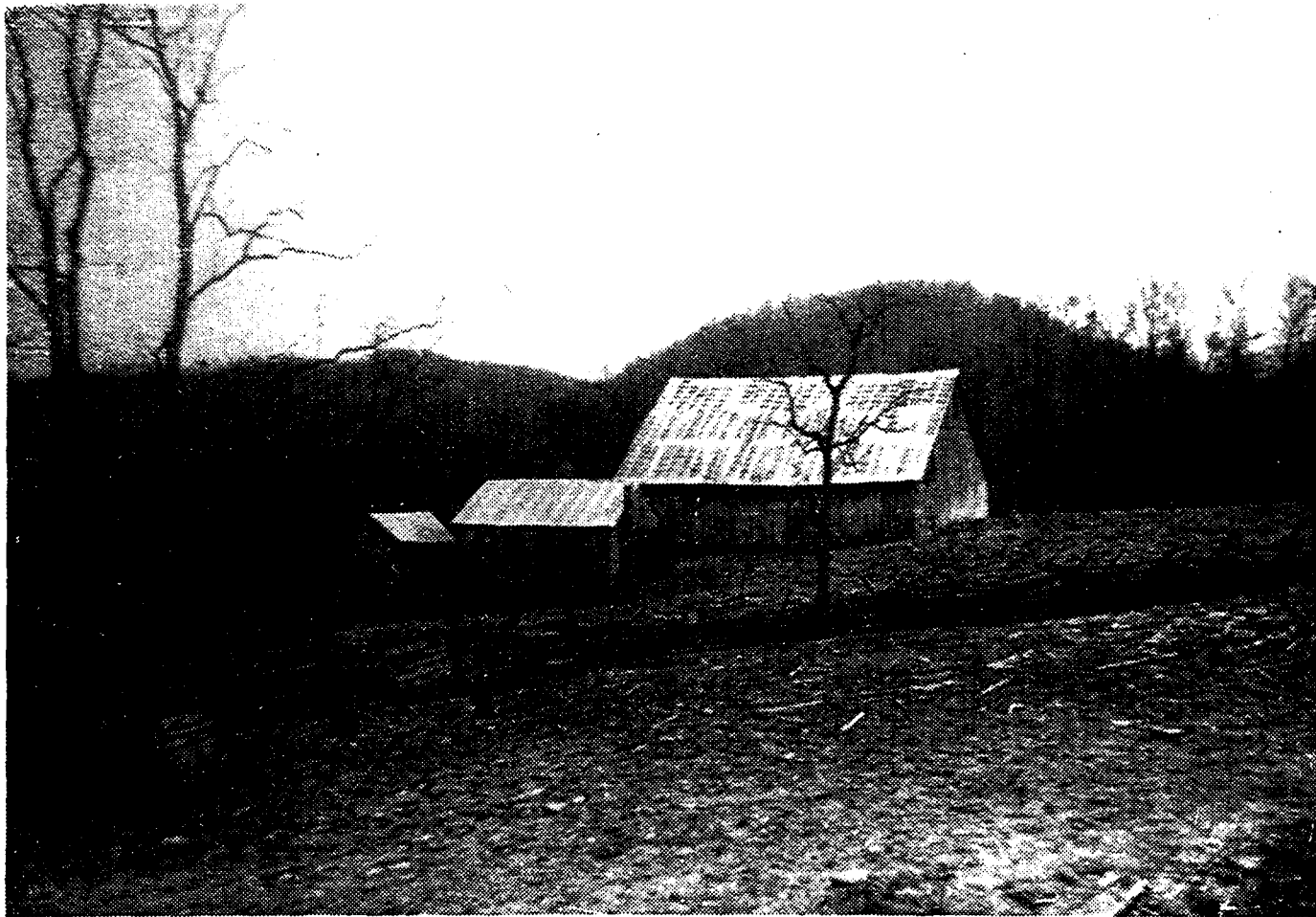
TWO VIEWS OF OLD HINER HOME, FLEMING COUNTY, KY.