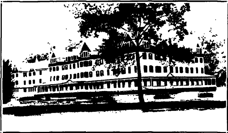
The Webster Springs Hotel

The population of Webster Springs has increased rapidly since 1930. The growth has been due to the development of the coal-mining and lumber industries. Two