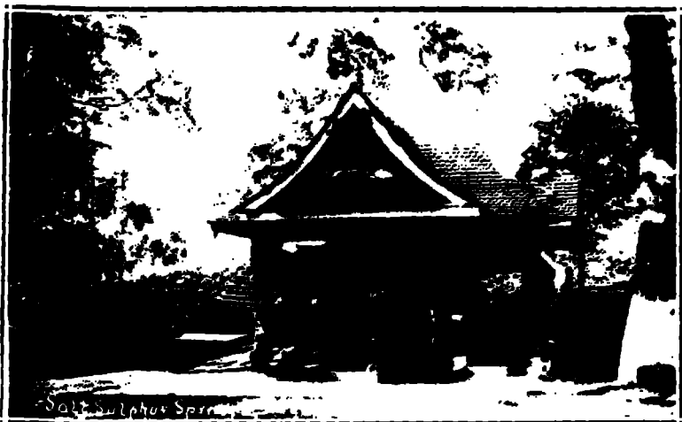
The Salt Sulphur Springs

Surrounded by McGuire Mountain, Miller Mountain, Point Mountain and the Gauley Mountain. Webster Springs, the location of the famous Salt Sulphur Springs.