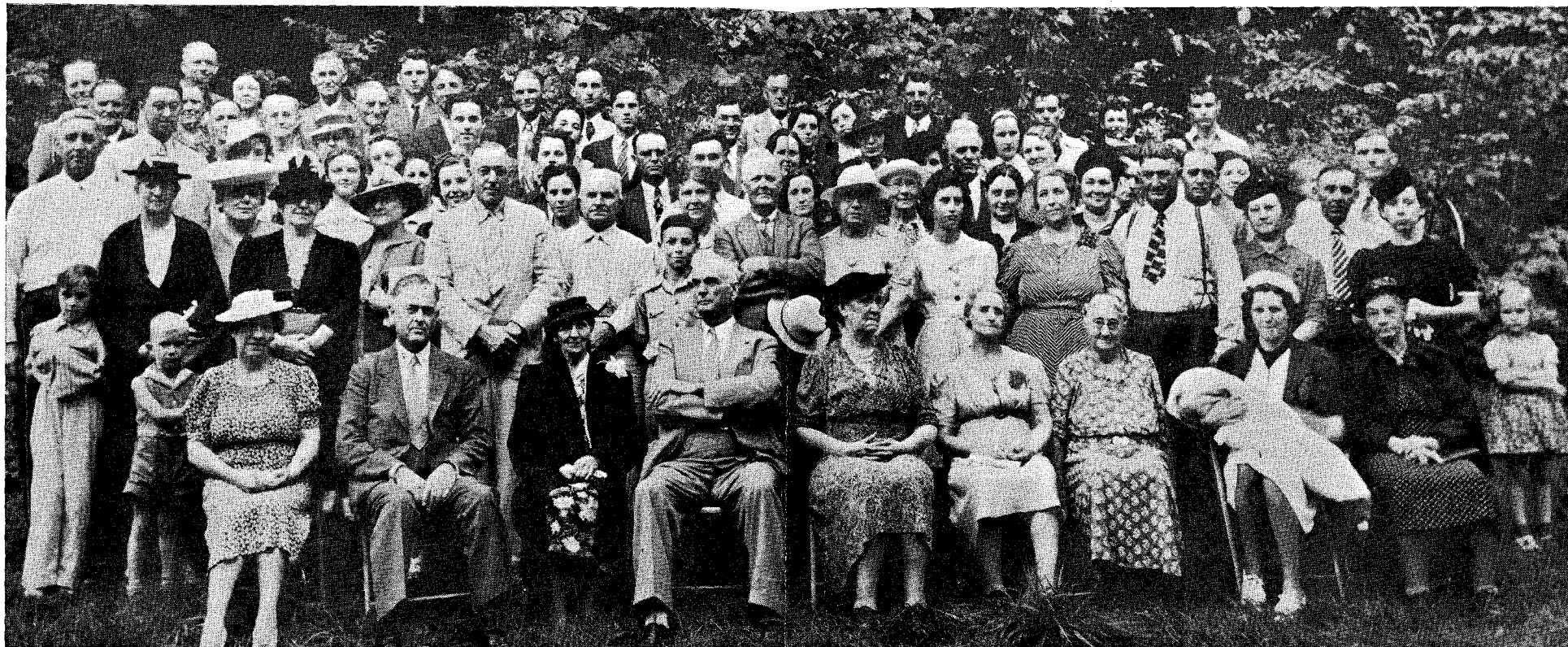
THE 1939 GARST REUNION GROUP HAMBURG, IOWA