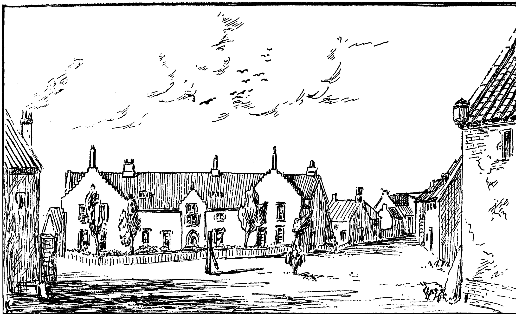
EARLY HOME OF THE GRESHAMS, NORFOLK, ENG.