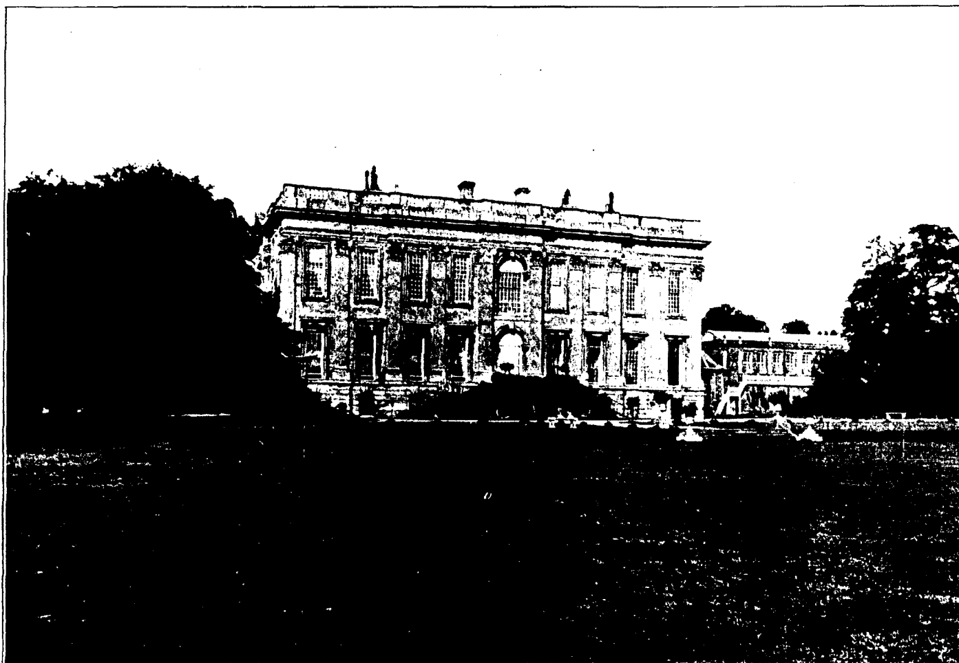
VIEW OF EASTON NESTON FROM THE FRONT