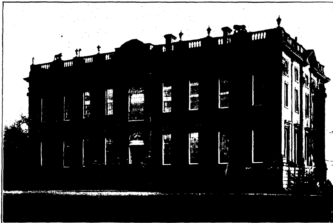
REAR VIEW OF EASTON NESTON