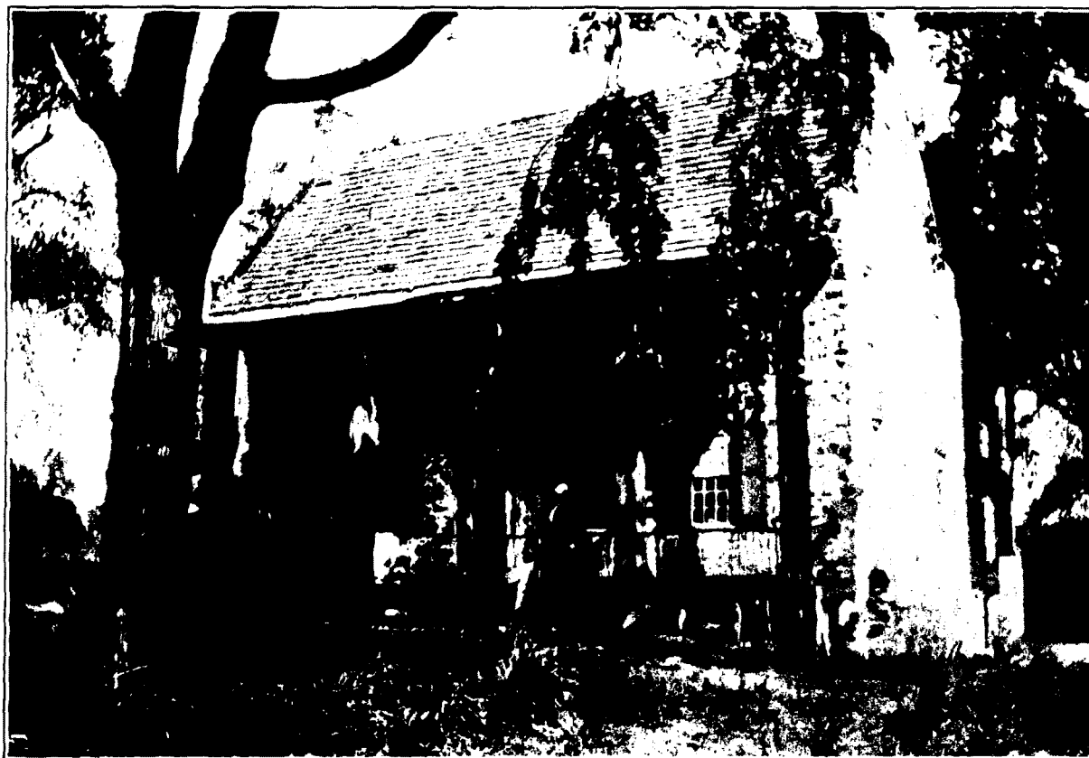
BENTLEY MANOR The "Old Billopp House," still standing on Staten Island