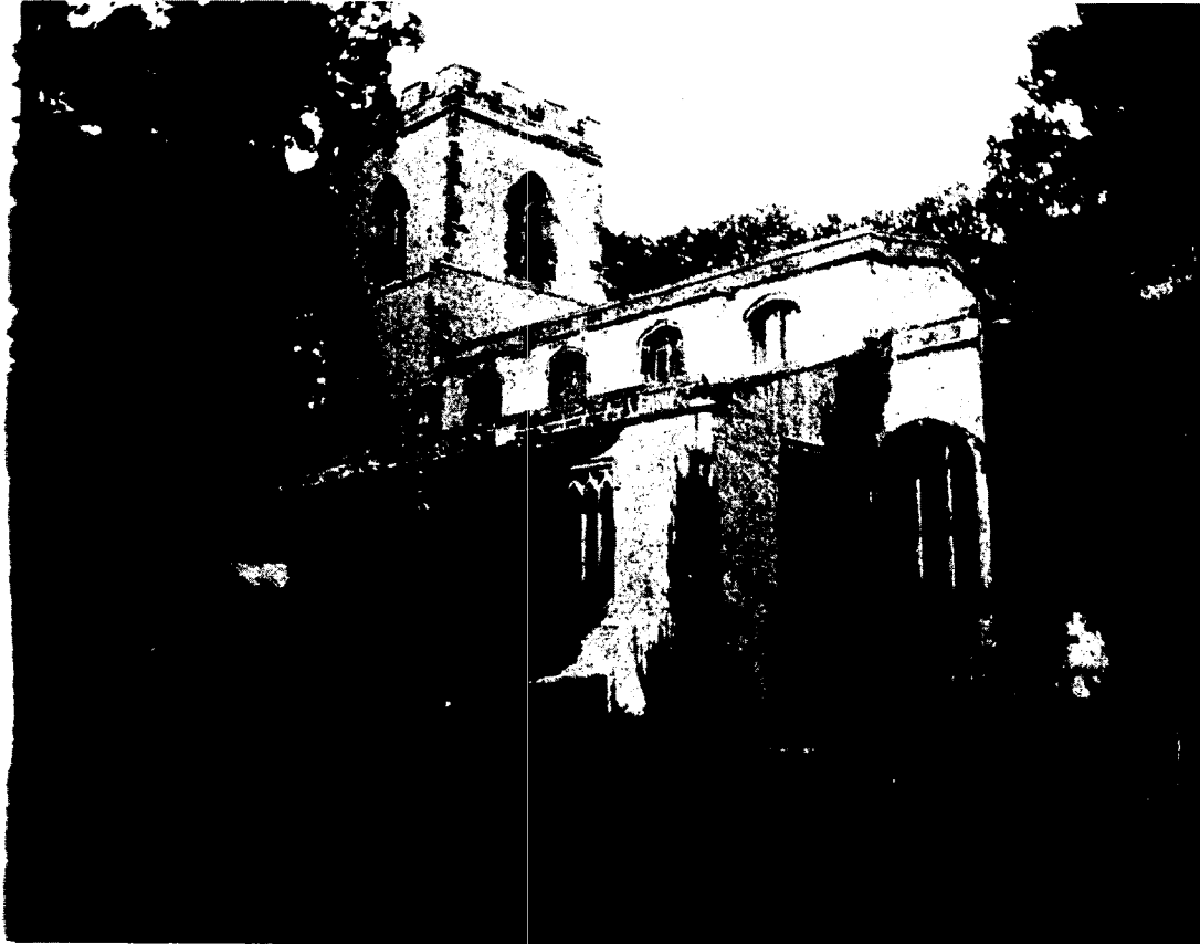
THE CHAPEL AT EASTON NESTON