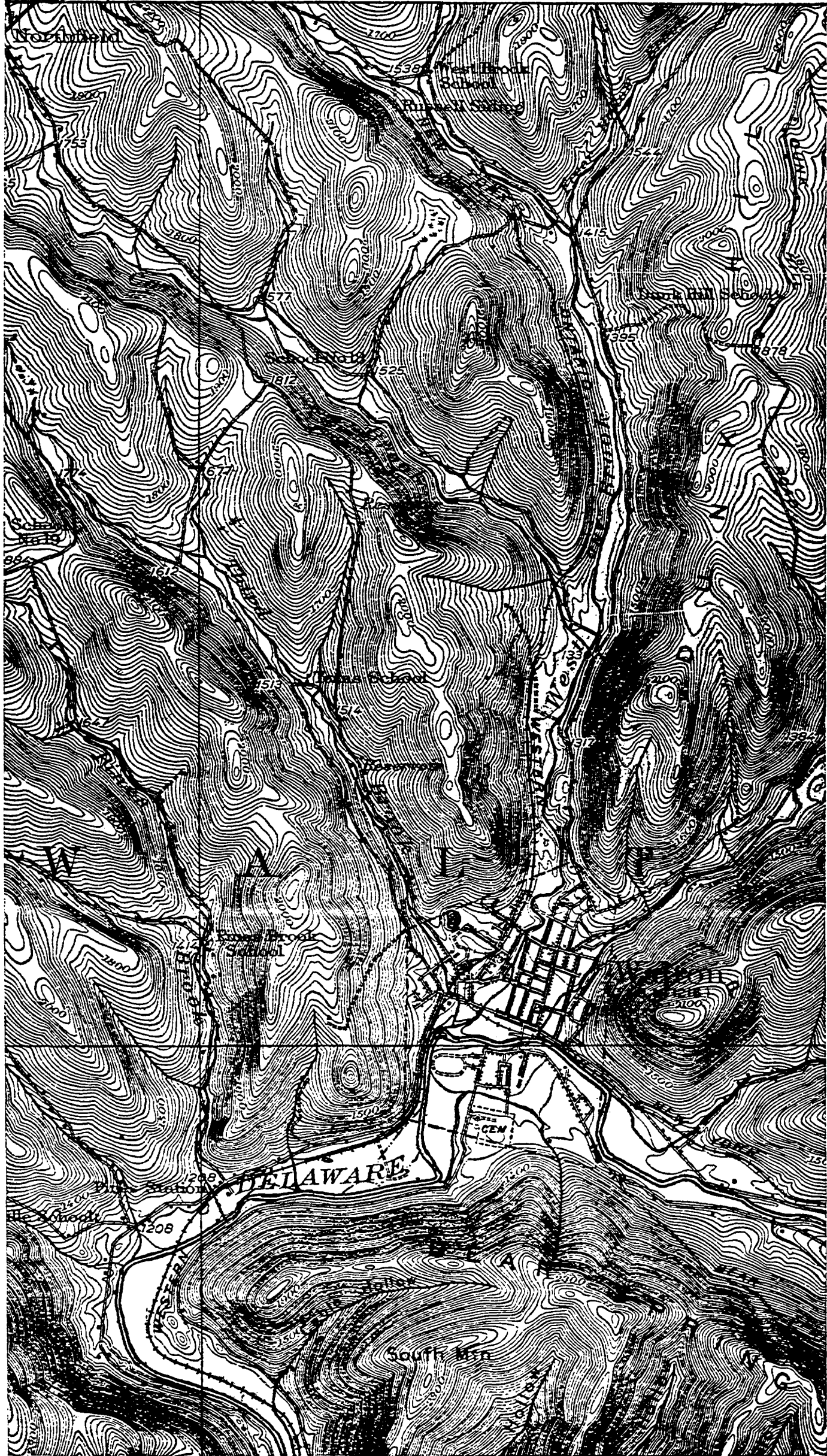
From WALTON QUADRANGLE, U. S. Geological Survey.