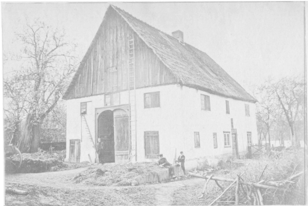
THE HOMESTEAD OF LABORIUS FAHNESTOCK, at Halten, in the Province of Westphalia, Prussia, and which stands in tact, at the present day as it was when Diedrich left it in 1726.