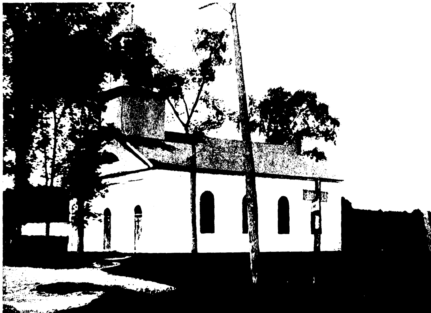
CHURCH IN HOLDEN.