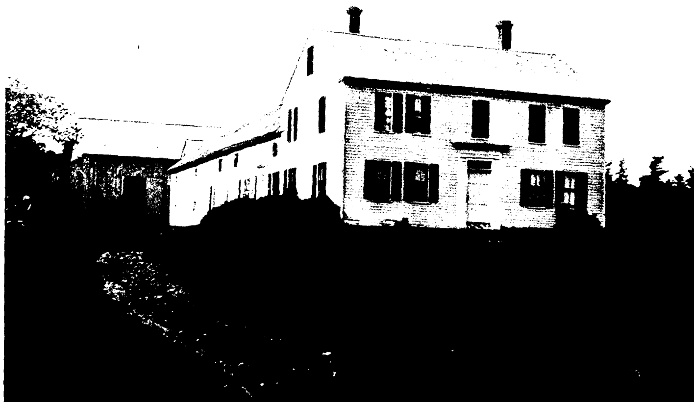
HOME OF BENJAMIN FARRINGTON.