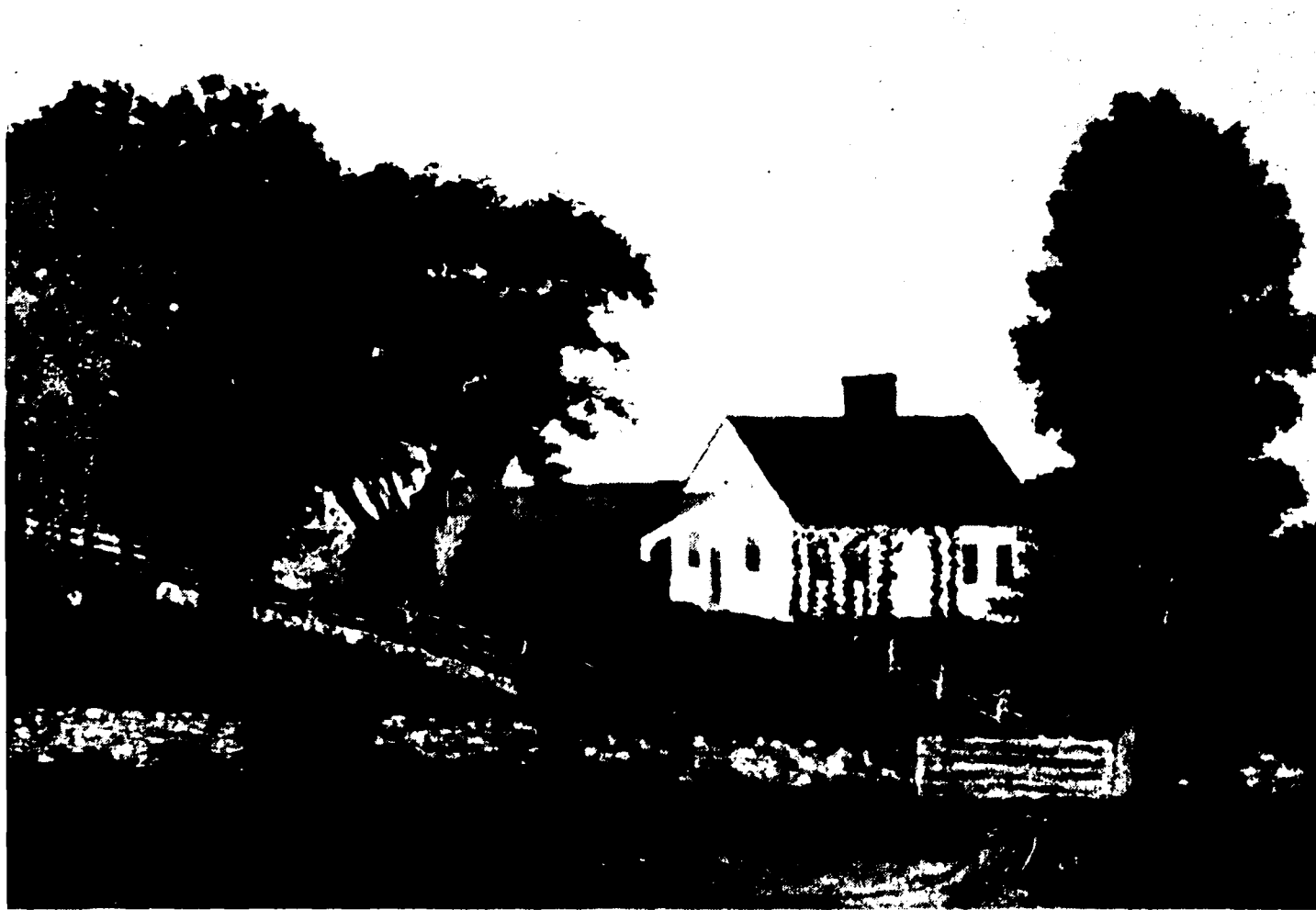
THE OLD HOMESTEAD.