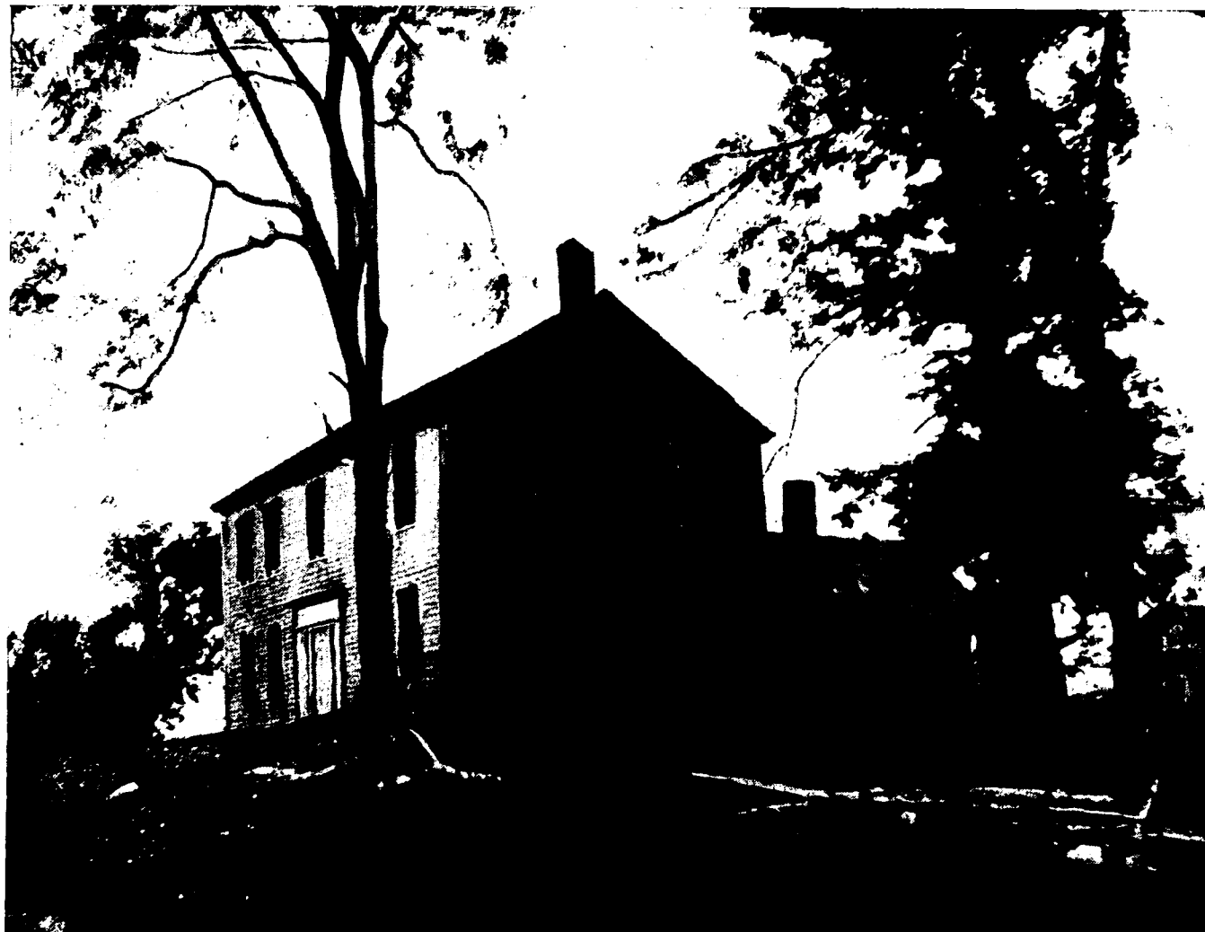
HOME OF PLINY FARRINGTON.