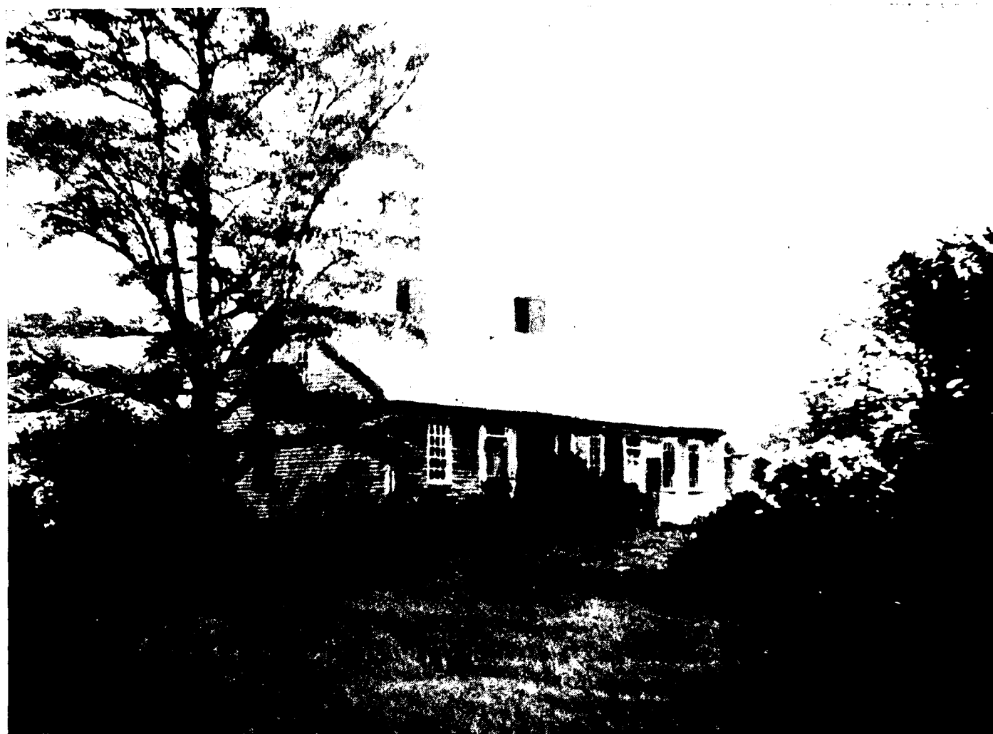
HOME OF NANCY HART.