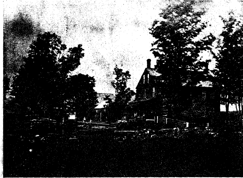
HOMESTEAD OF STEPHEN FOSTER, E. MONTPELIER, VT.