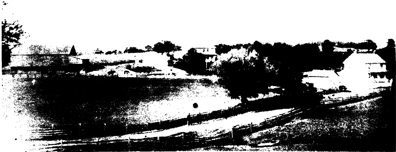
THE ENDERS HOMESTEAD IN 1874. ORIGINAL LOG-CABIN AND FAMILY BURIAL PLOT, LOCATED IN TREES ON HILLSIDE.