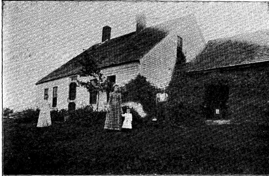
THE OLD DINSMORE HOMESTEAD