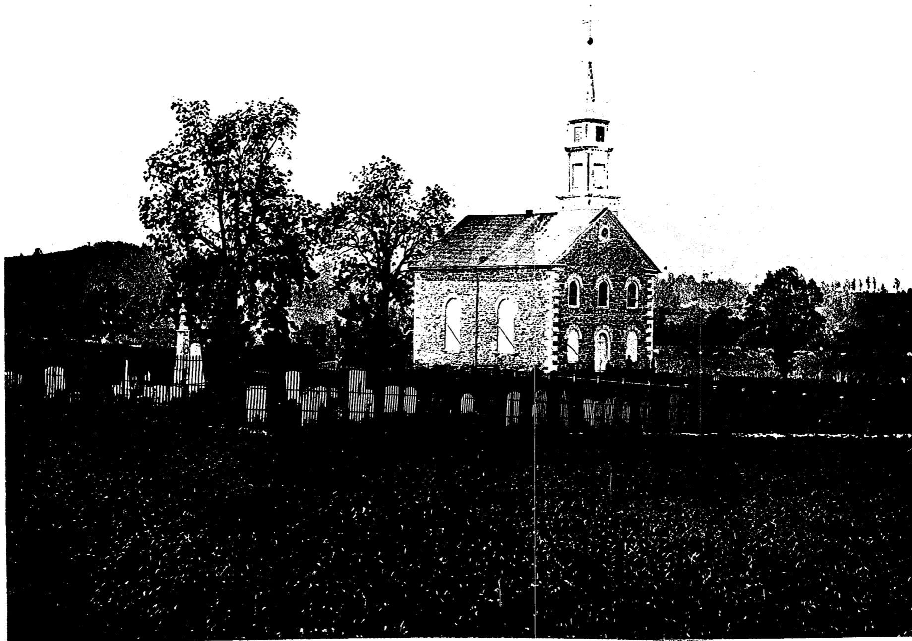
HOST CHURCH ERECTED IN 1775.