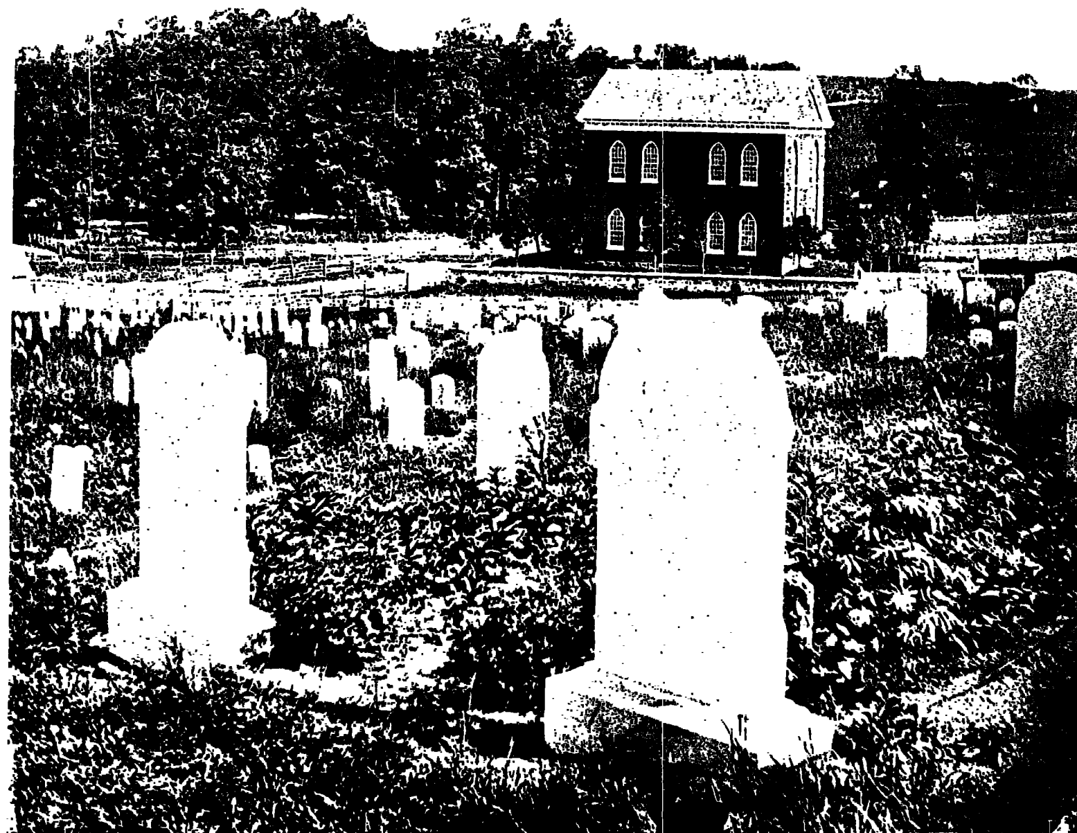
BERN CHURCH AND GRAVE-YARD.