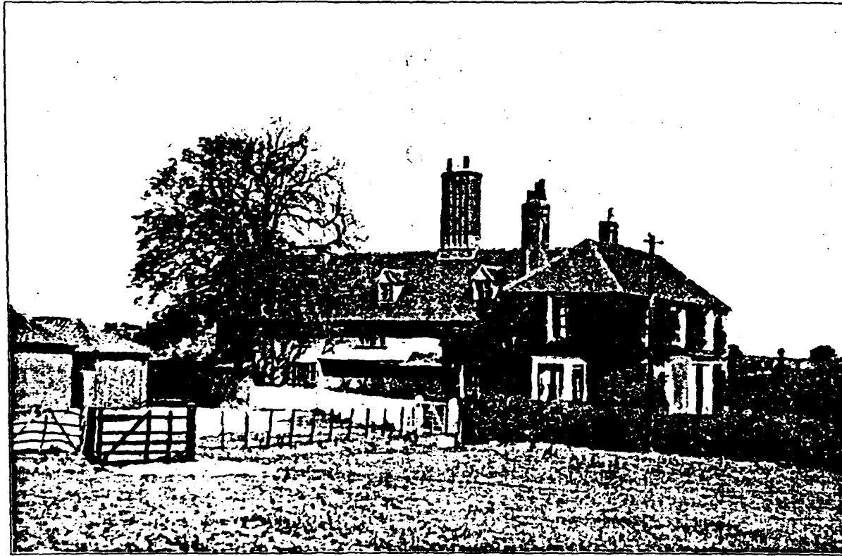
CODHAM HALL, WEATHERSFIELD, ESSEX

The family of Coggeshall became proprietors of this estate in the reign of King Edward, 1272.