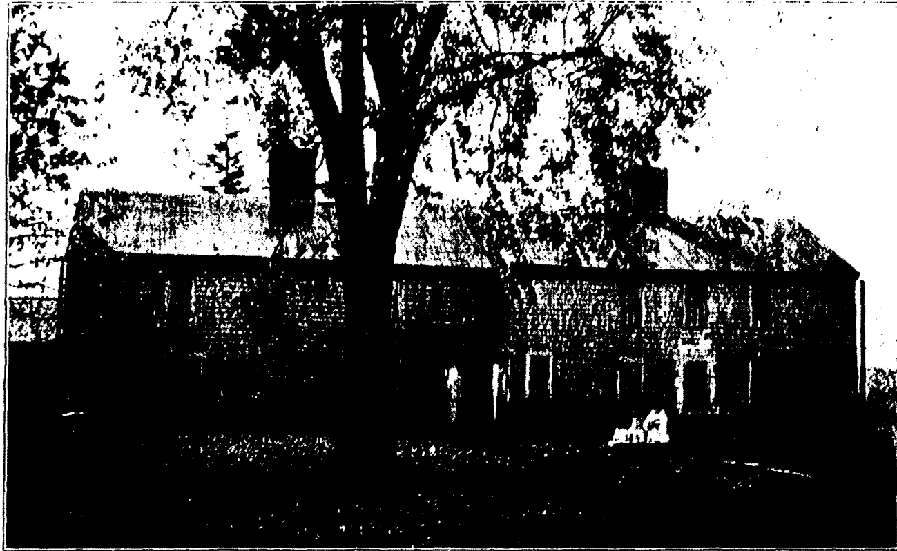
THE CUMMINGS-BATCHELDER HOMESTEAD.