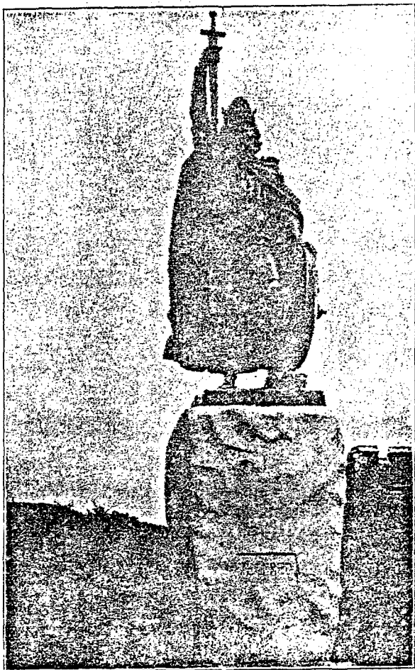
STATUE OF KING ALFRED THE GREAT AT WINCHESTER.