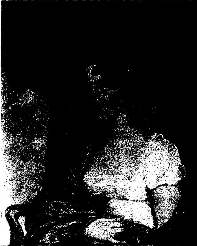
Portrait by Gilbert Stuart.