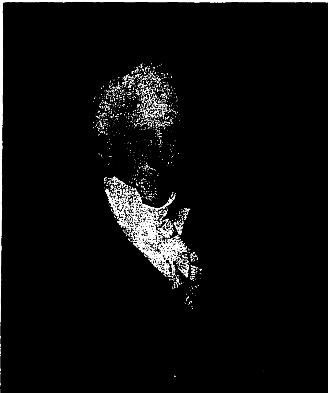
Portrait by Gilbert Stuart.