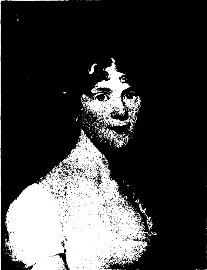
Portrait by Gilbert Stuart.